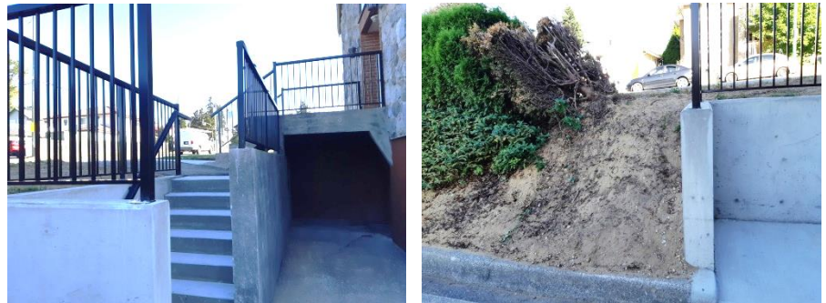
Finally! The cement has been poured...new railings installed...access to the 10 th Avenue office entrance restored. Now we await restoration of the landscaping!