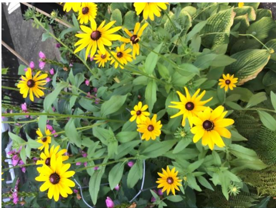
Flowers from Honouring Memories, Planting Dreams seed packet, planted on the day we created the Heart Garden at Mount Zion

Mount Zion’s experiments began with the Neighbourhood Book Nook. Hoping to build on this we offered the congregation and neighbours the opportunity to learn more about the legacy left from Residential Schools. We learned and worked together on how we might commit to our own plans toward truth and reconciliation, through Honoring Memories Planting Dreams.